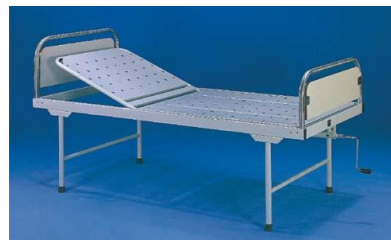
FIXED HEIGHT, RAISING BACKREST, TWO-WAY LONGITUDINAL TILT